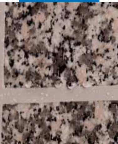
Sealing an external stone dressing