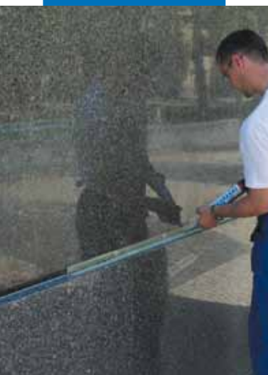
Sealing a façade joint with Mapesil LM

All relevant references for the product are available upon request and from www.mapei.com