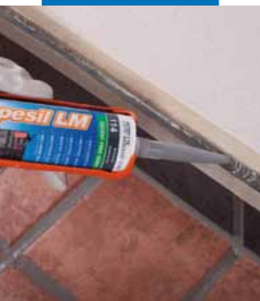
Sealing an internal stone dressing